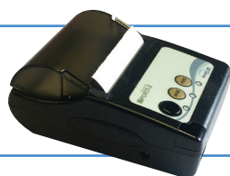
Mentor bluetooth printer (optional)

Up to 50 test results can be stored by vehicle registration or VIN. The USB connection together with the Automotive Refrigerant Configurator PC app can be used for software updates, sensor calibrations and simulating connection to a refrigerant recycling station.